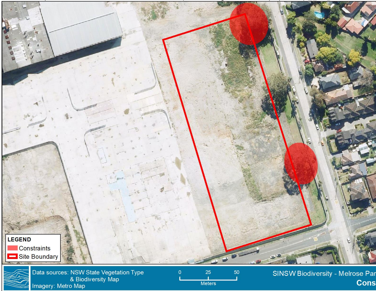
Figure 9-2 Constraints Map

The proposal does not involve the removal of any trees; all existing trees are outside the site boundary and will be incorporated into the Wharf Road Reserve (refer to Figure 9-1 for proposed plans and