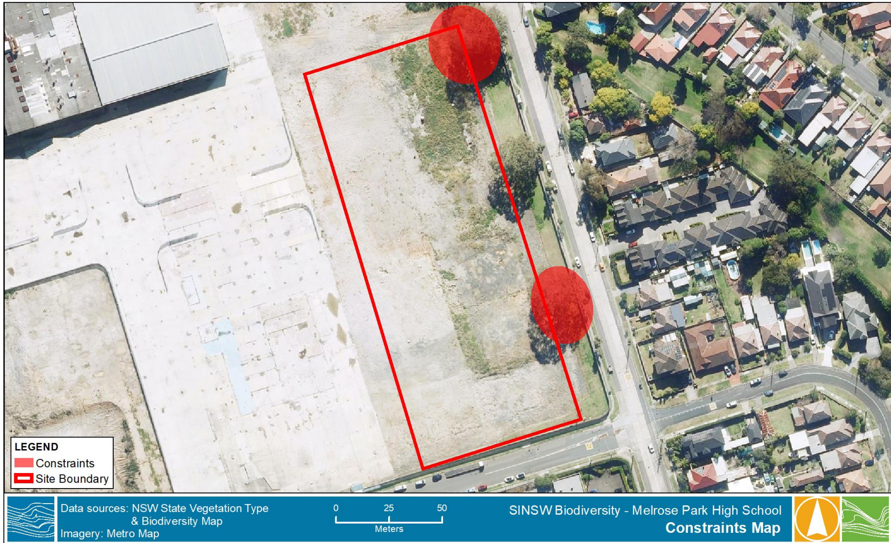
Figure 9-2 Constraints Map