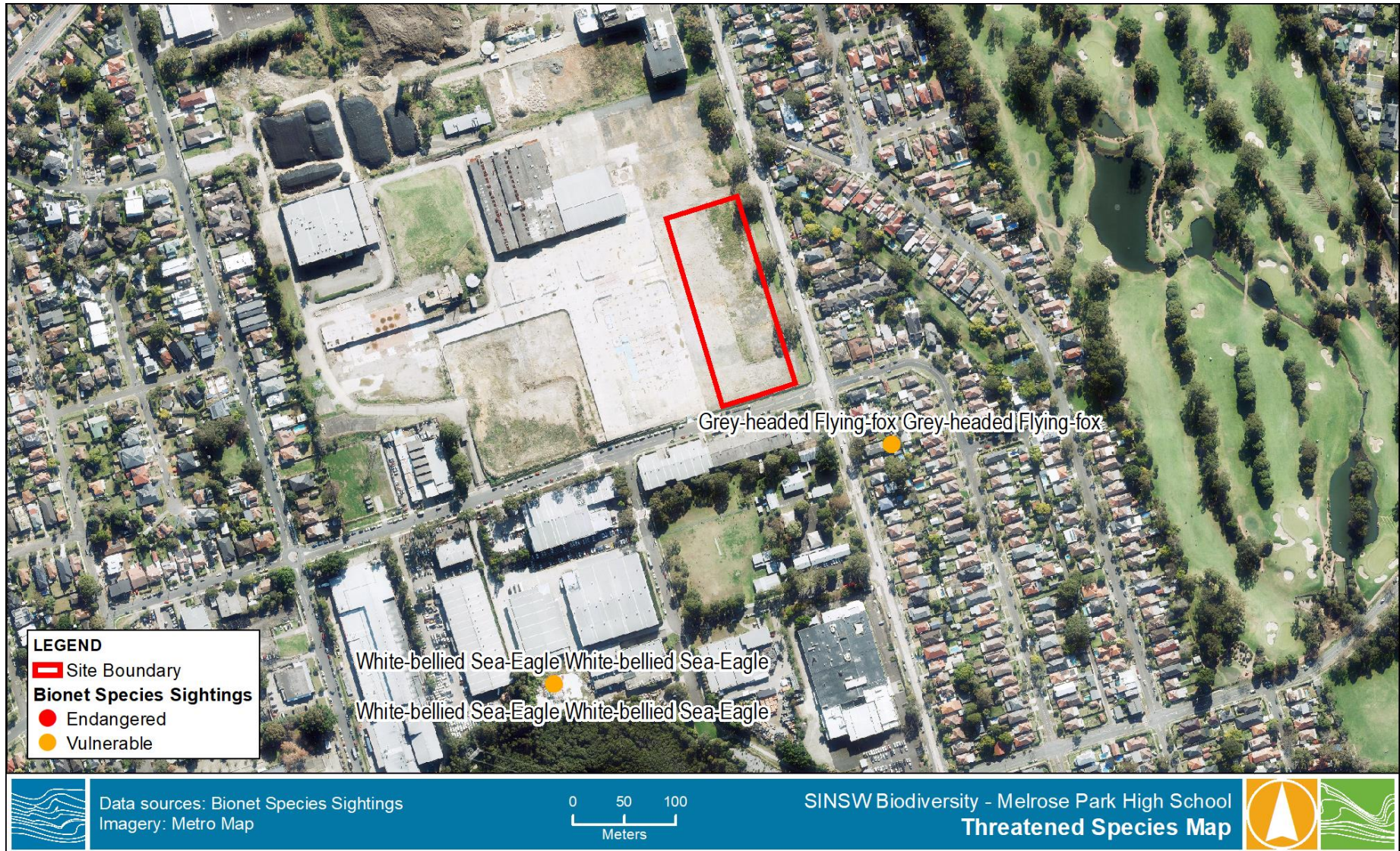
Figure 7-3 Threatened species