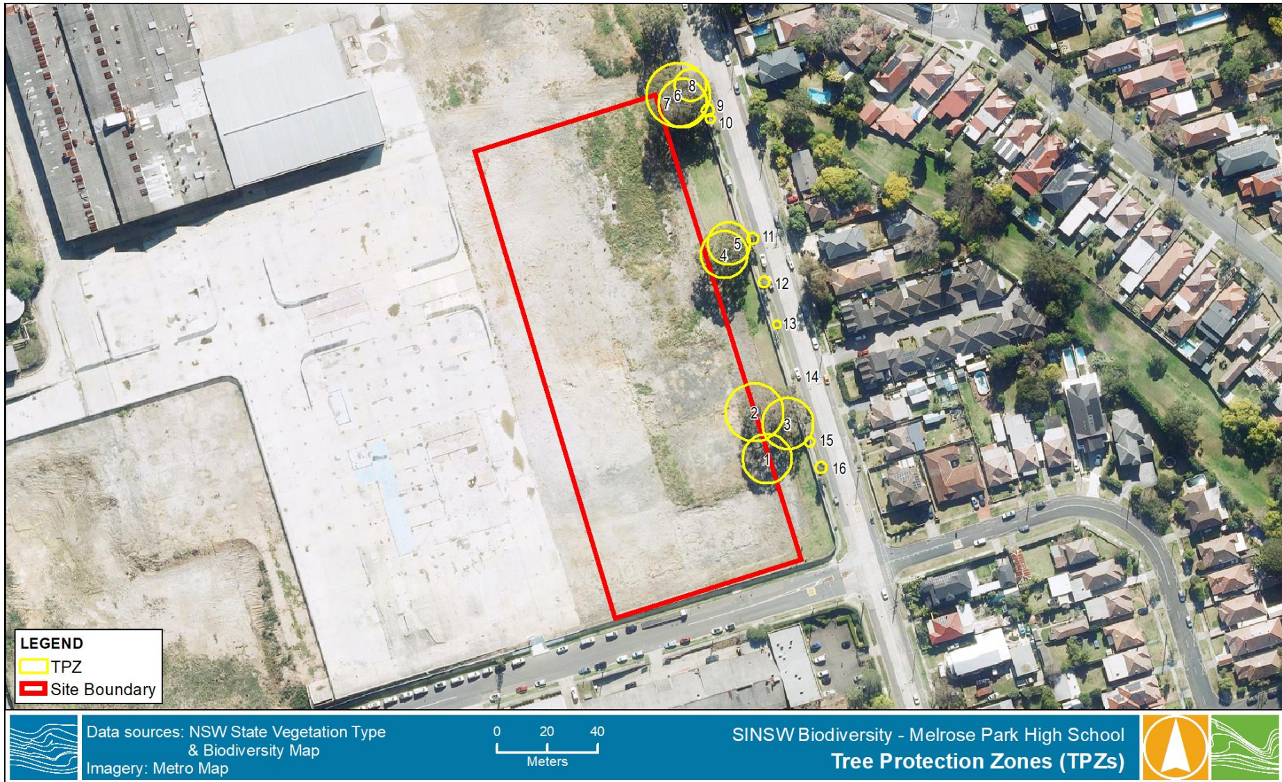
Figure 7-4 Tree Protection Zones