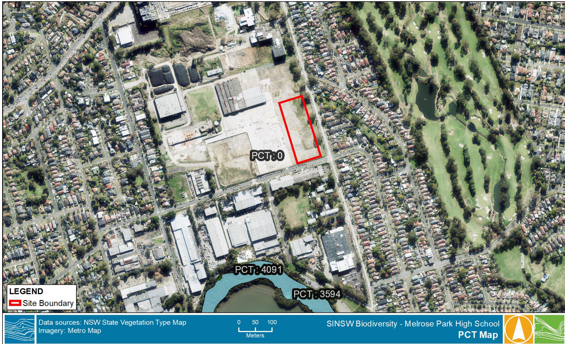
Figure 7-1 Plant Community Types