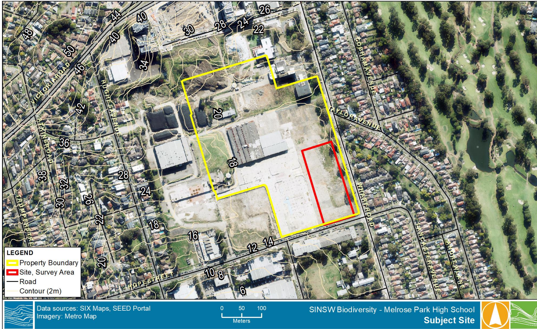
Figure 5-1 Site Aerial