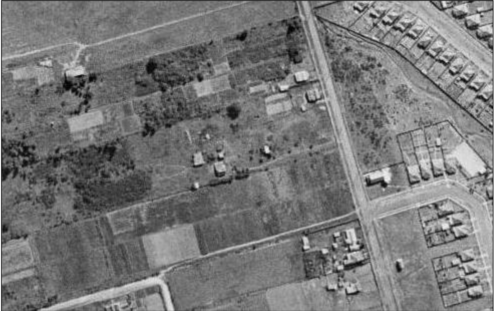
Figure 7-2 Historic Image